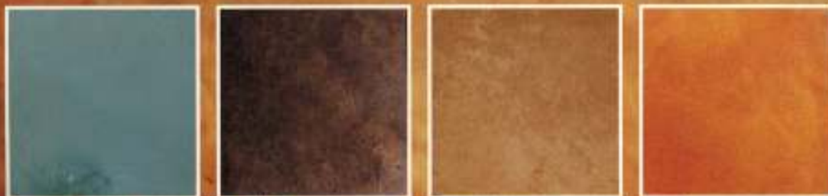
azure pool blue